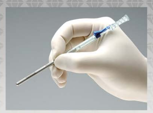
Making the bone harvesting a handy procedure

The experience META has acquired in developing bone harvesting systems Safescraper has allowed the realization of Micross: a throwaway minimally invasive disposable device indicated in case of manual cortical bone harvesting. The excellent cutting performance, due to Micross exclusive micro-blade, allows an easy autologous collection even in narrow and hard to reach areas, near to the bone defect. The manual harvesting technique warrants the best preservation of cell vitality of the cortical tissue. a fundamental characteristic that allows the best graft integration and reduces reabsorption activity.